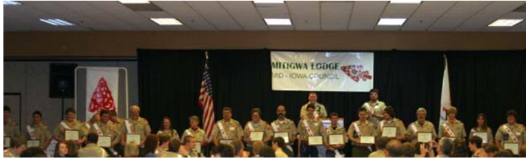
Vigil Honor members 2007