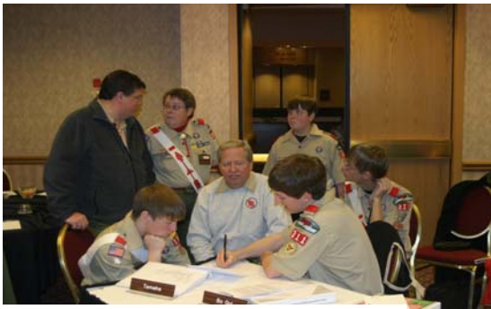
TAMAHA prepares for discussion