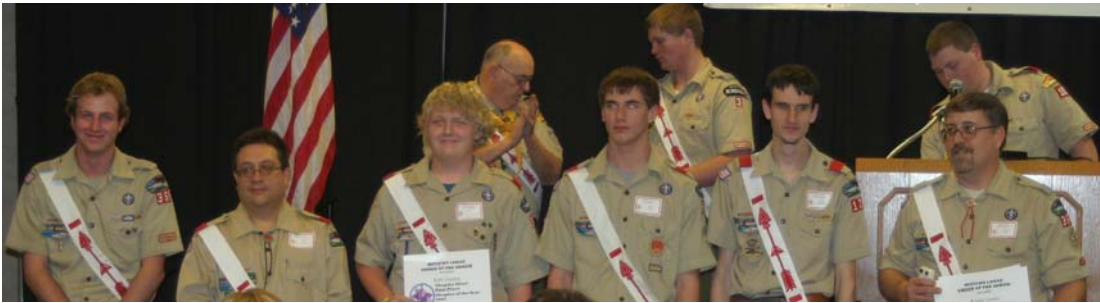
Chapter of the Year 2007—Bo Qui Officers and Advisers