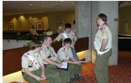
Broken Arrow planning for LECM