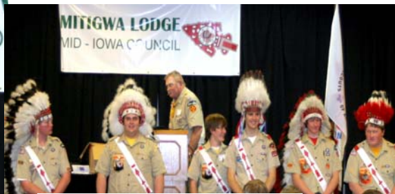
The bonnets are passed!