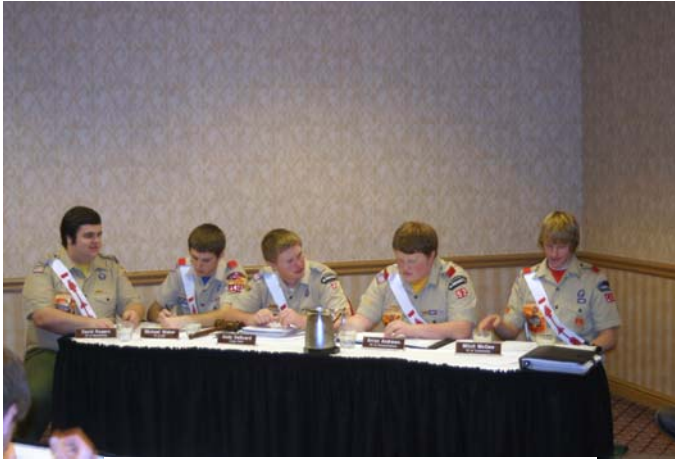
Lodge Officers prepare for LECM