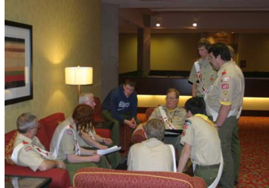
RRV Chapter meets at LECM