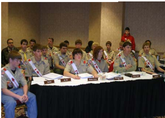
Chapter Chiefs at LECM